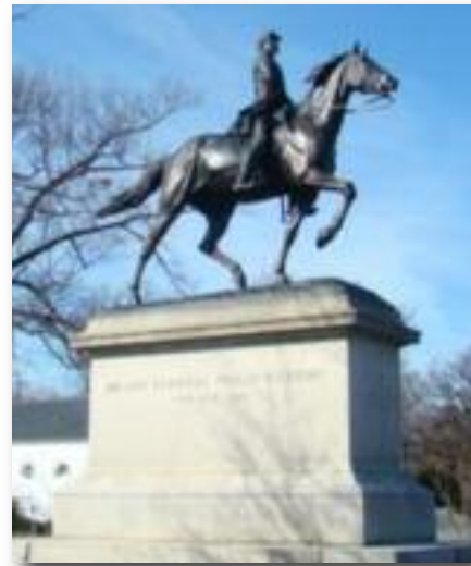
General Philip Kearny's remains were reinterred at Arlington in 1912, 50 years after his death.