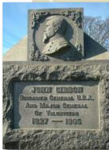
Famed Iron Brigade commander John Gibbon is buried in Section 2, Lot 986.