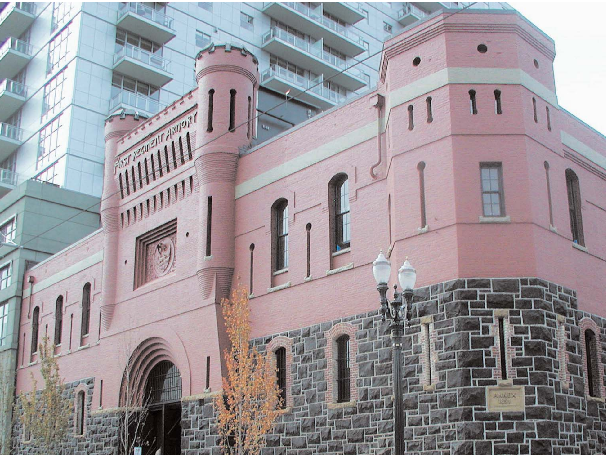
Now surrounded by modern buildings, the First Regiment Armory Annex in Portland, OR, has changed little – at least on the exterior – since it was built in 1891. Now home to the Gerding Theater, including office and meeting spaces, the building is the first structure listed on the National Register of Historic Places to earn a LEED platinum certification.

gains and “disposal architecture”; and the costs of green preservation as opposed to new construction.