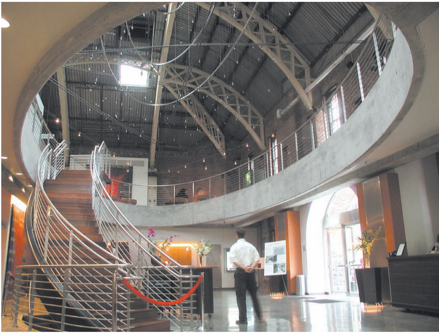
In one of the boldest moves in the interior, the armory renovation team designed a large oculus in the second floor that preserves views from the first floor to the building's historic wood roof trusses. Other sustainable elements included new skylights for natural daylighting, which were actually part of the building's original design.

Rhonda Sincavage, a public policy associate at the National Trust, “but we also want people to think about the impacts avoided by not disposing of these buildings.”