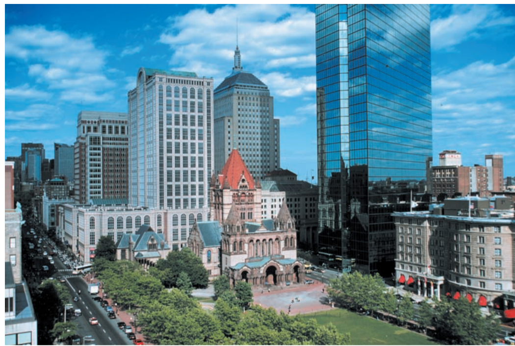
Surrounded by the glass and concrete office towers, Trinity Church is a bastion of traditional design in Boston, presenting a special challenge to the architects charged with rehabilitating – in a sustainable manner – the space for offices and meeting rooms.

Originally erected to serve the Oregon National Guard, the building has now been transformed into the Gerding Theater, which includes a 600-seat main theater and a 200-seat studio theater, as well as a lobby, mezzanine and offices. In seeking the LEED certification, the renovation team was careful to preserve historic