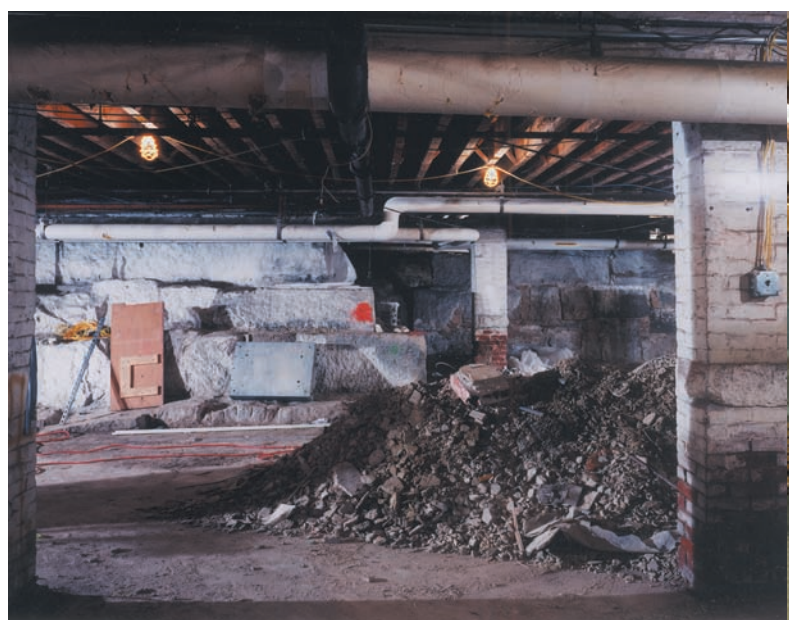
The new undercroft at Trinity Church makes the most of "found space" beneath the sanctuary. The structure's mammoth stone foundations are still visible in the completed space, which has a contemporary feel in keeping with its less formal purpose.

Major challenges, according to the authors, include the lack of coordinated public policy encouraging green/historic initiatives; the lack of significant public investment and interest in these undertakings; the inflexibility between green-building guidelines and preservation standards; the cultural focus on short-term