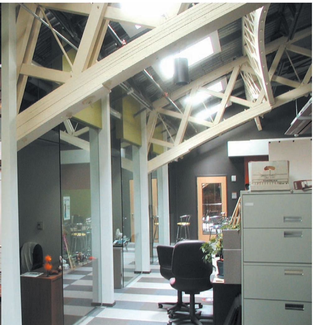
Above: Massive trusses hewn from old-growth wood are among the most character-defining elements of the historic 1891 building and were carefully preserved even in the tricky modern office spaces.